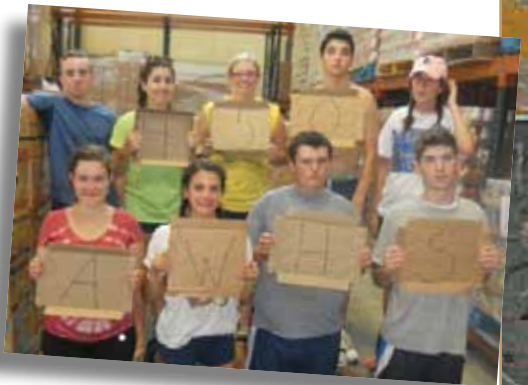
We packed 450 boxes of supplies for needy families at a local food pantry.

This was one of the best parts of the trip for me. I learned a few things on this trip. I realized that despite being the greatest nation in the world, America has a serious problem with poverty that needs to be addressed. I learned that no matter how little some people have to give, they are happy to share. This was demonstrated by my fellow parishioners at St. Francis of Assisi who helped greatly to sponsor our trip and by the residents of Dunbar who shared their homes and food with us while we worked in their community.